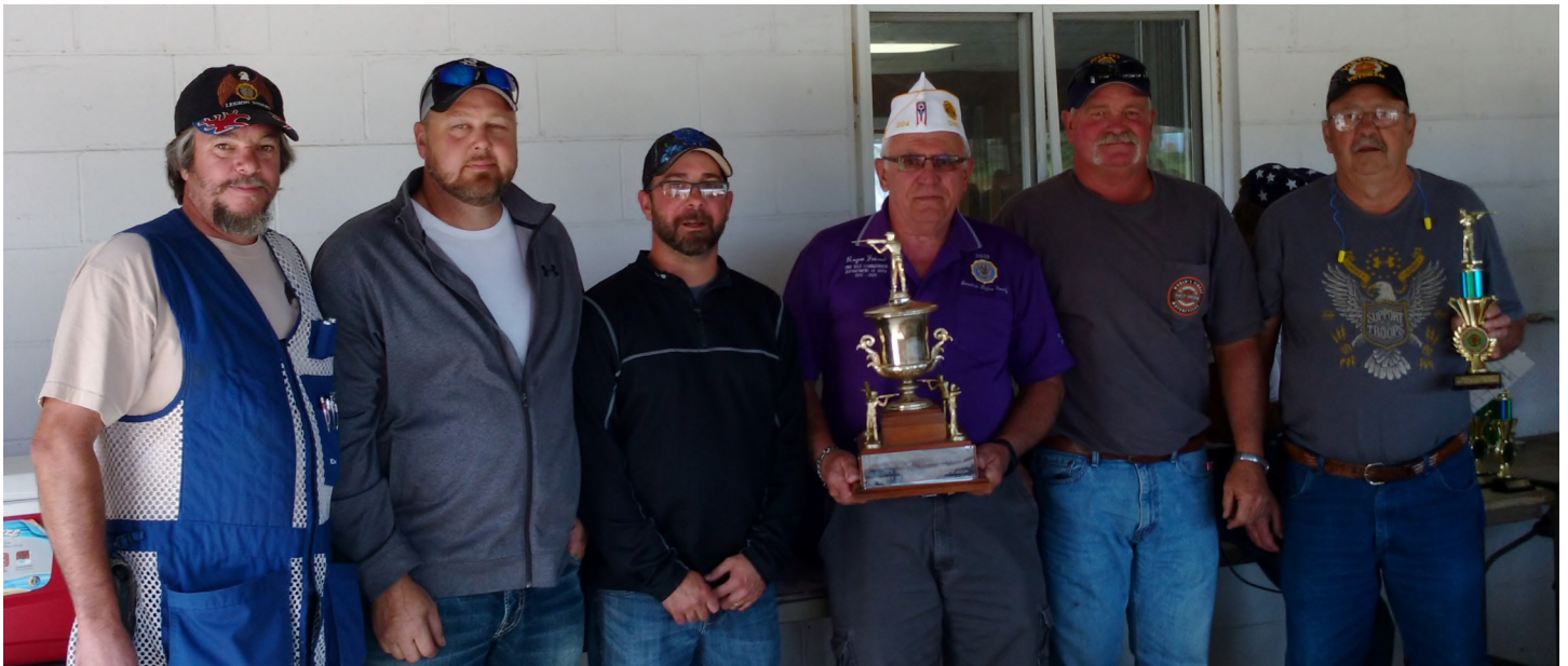
5 man team runner ups.