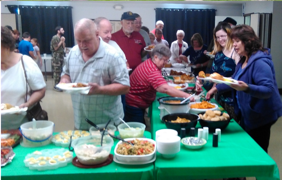
2017 DISTRICT PICNIC AT JOHNSTOWN GOOD FOOD GOOD FRIENDS GOOD FUN!! HOPE TO SEE YOU NEXT YEAR!!!